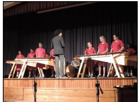
Jnr Prep Marimba Band, "The Tiny Terrors"