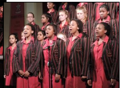
High School Choir