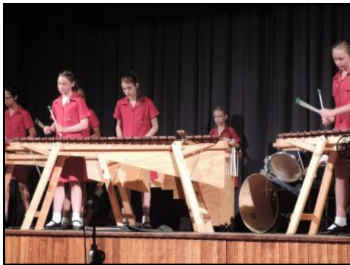
Snr Prep Marimba, "The Cool Kids"