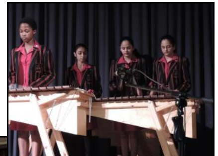
High School Marimba Band