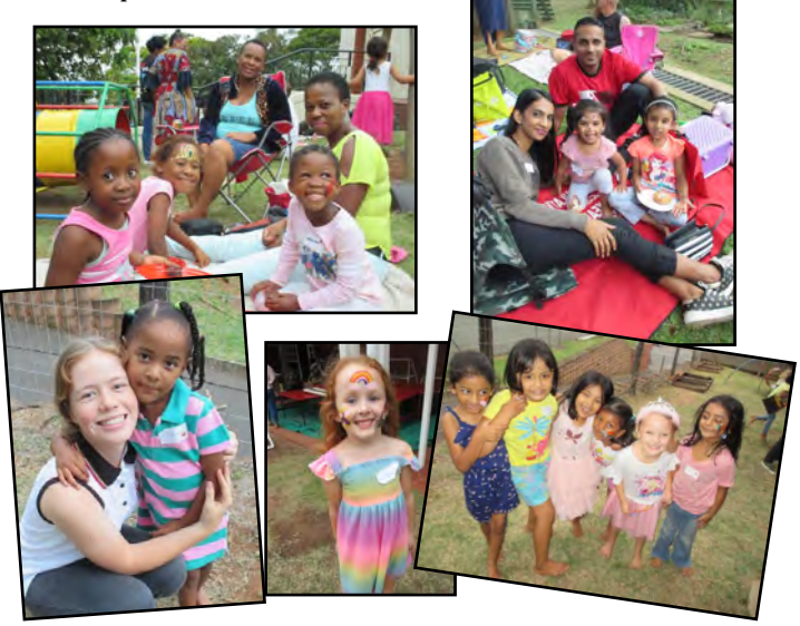
Grade 1 Easter Fun

We had such a lovely evening at our Pre-school Family Supper Picnic early in the term, with perfect weather for a change! The girls had the most wonderful time having their faces painted and then being entertained by our amazing Grade 12 Mentors. Happy memories were made by all who attended – thank you to everyone for making it such a special event.